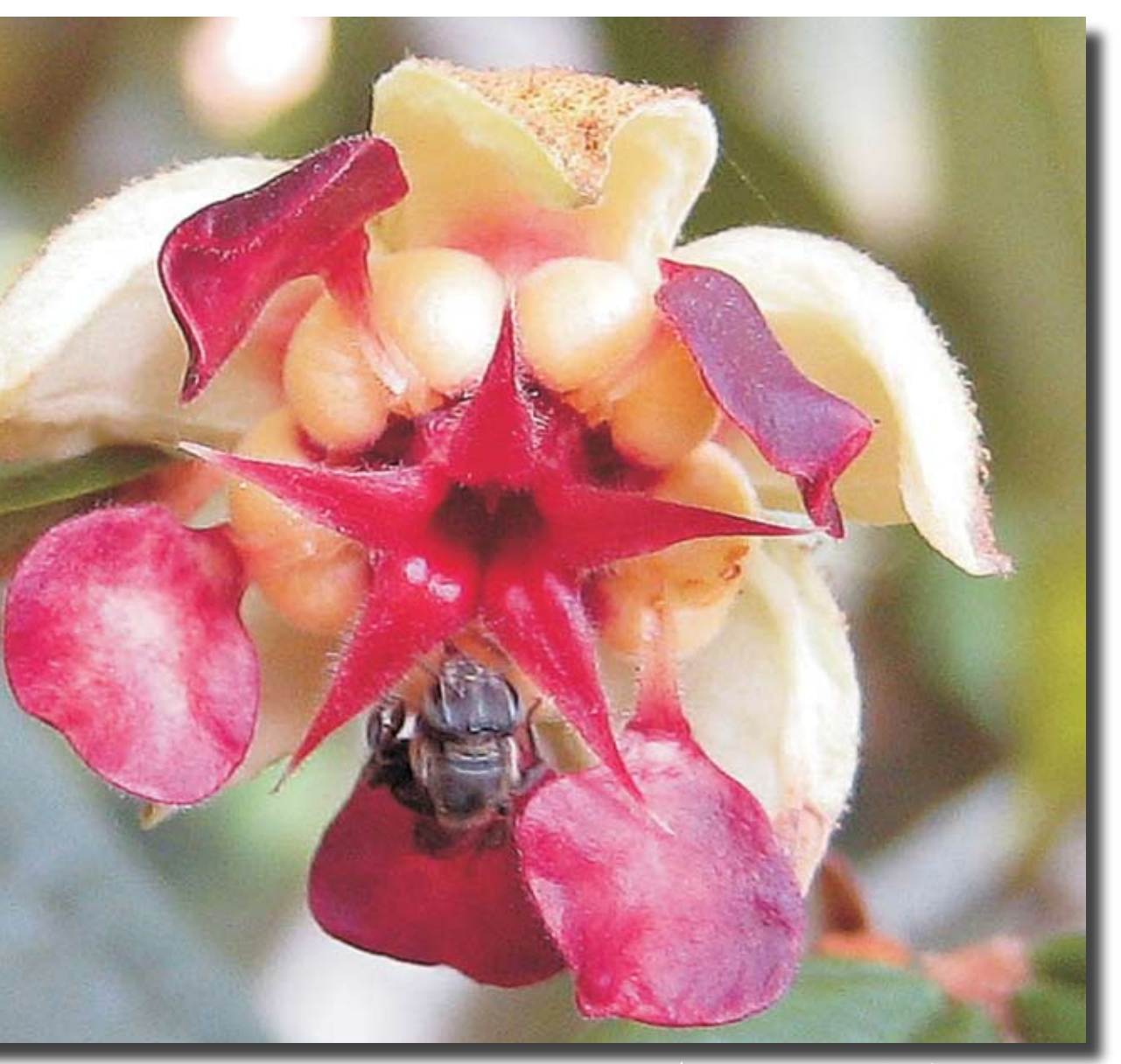
Aparatrigona impunctata in T. grandiflorum flower.

2005. In both plantations we compared fruit-set in days with and without the itinerant meliponary. For both areas the fruit production of T. grandiflorum was higher in the days when hives were introduced into the plantations, but only in the area 2 the difference was statistically significant.